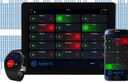
Agent-IC on various mobile devices