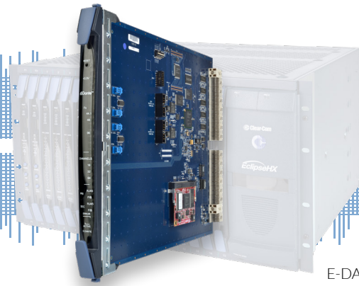
E-DANTE64-HX Interface Card