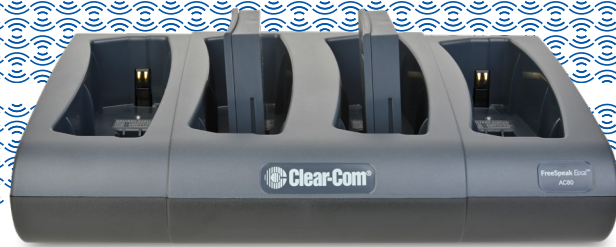
AC80 Battery Charger